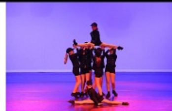
Jazz & Hip Hop