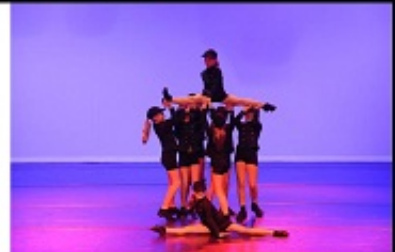
Jazz & Hip Hop