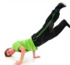
Boys Street Funk

Visit our website or call us to arrange an obligation - free trial class.