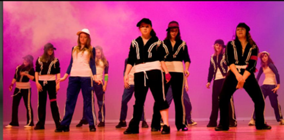
Jazz & Hip Hop