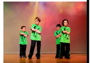
Boys Street Funk

Visit our website or call us to arrange an obligation - free trial class.